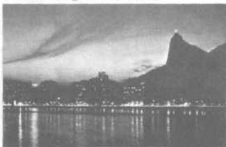
2. THE WORLD-FAMOUS COPACABANA was my home during my stay in Brazil!

3. DEAREST FAMILY AND FRIENDS: Greetings from the beautiful land of South America and from all the Latin Children of God who live there!--And from the pioneers who have laboured there now for almost four years founding our youth communities, called Colonies, from one end of this great continent to the other, to show the Love of God to its people by a living sample of what Jesus taught; loving and sharing, and helping those in need! They are offering to its youth an alternative to drugs and selfish living, violence and hate, racism and social prejudices of every kind, and replacing meaningless religions and philosophies with simple love and faith in God, and singing boldly "You Gotta be a Baby to go to Heaven"!