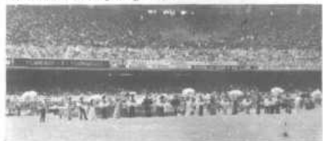
Children of God singing in Maracaña Stadium