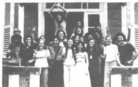
200 young people in about 22 Colonies throughout Brazil -Our Colony in Porto Alegre-

21. IN OUR SECOND AND MOST RECENT MEETING WITH HIM WHERE WE HAD LUNCH TOGETHER in a very exclusive restaurant in Rio, we talked for three hours about our work in Brazil and the future of our music and recordings and shows. He was very pleased when we told him of the progress we have been making in Brazil, numbering now almost 200 young people in about 22 colonies throughout Brazil, and that alot of our success has been due to the music which he has helped us to produce and distribute in thousands of Brazilian homes!